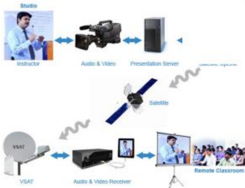
EnerJEE RPSC Education-Network